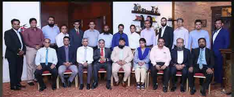
Quickbiz Successfully managed the training on

"Information Security Governance and Risk Management"